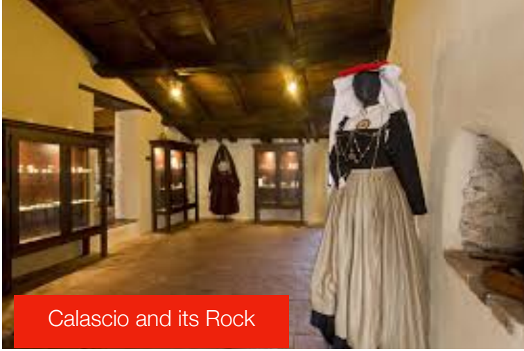
Calascio and its Rock