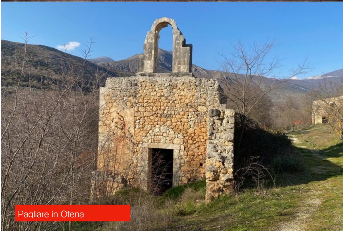
Paqliare in Ofena