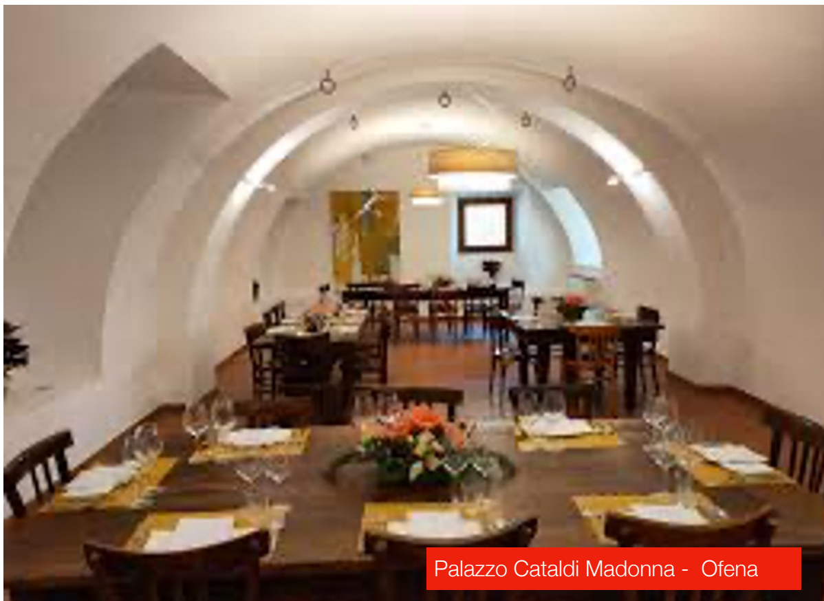
Palazzo Cataldi Madonna - Ofena