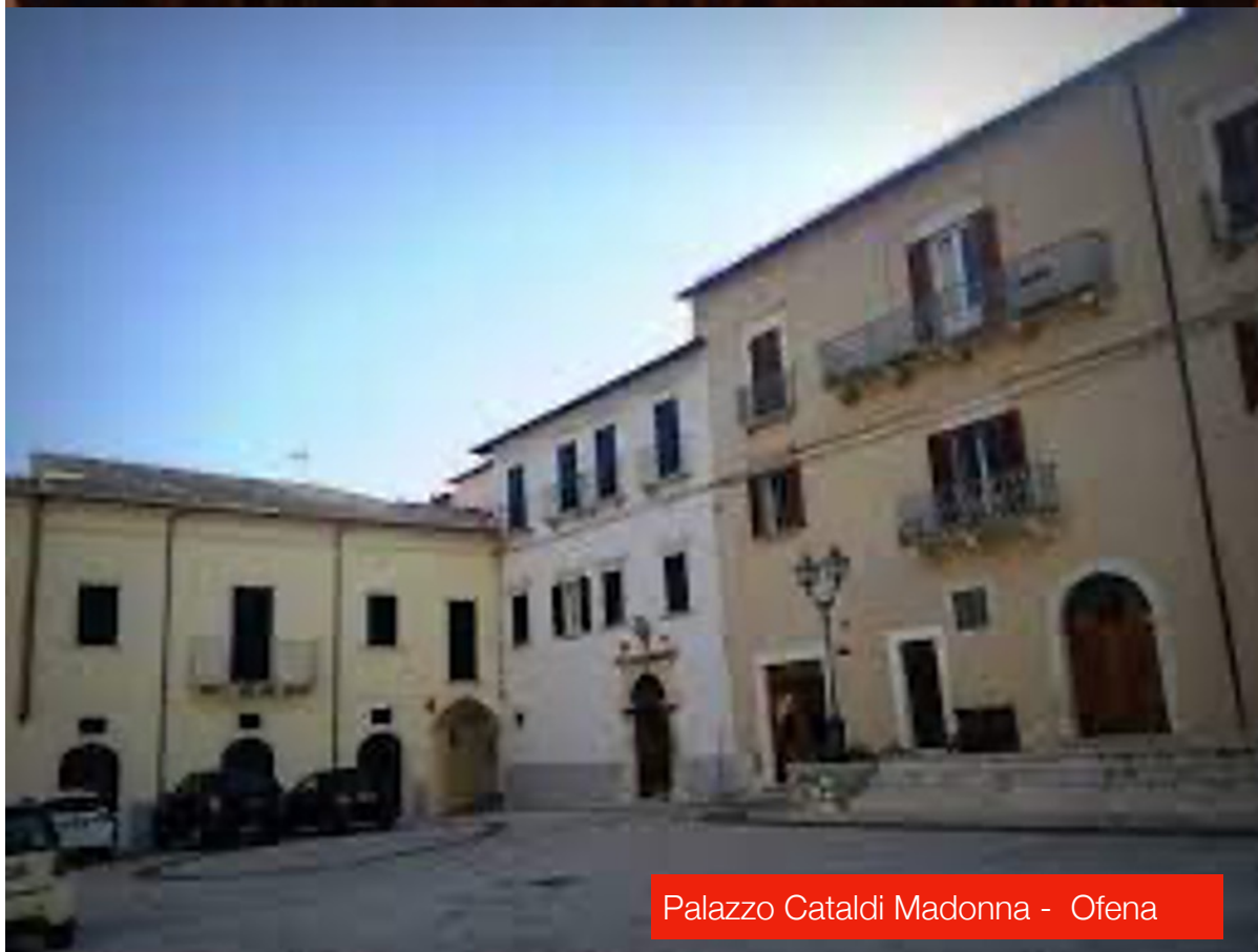
Palazzo Cataldi Madonna - Ofena