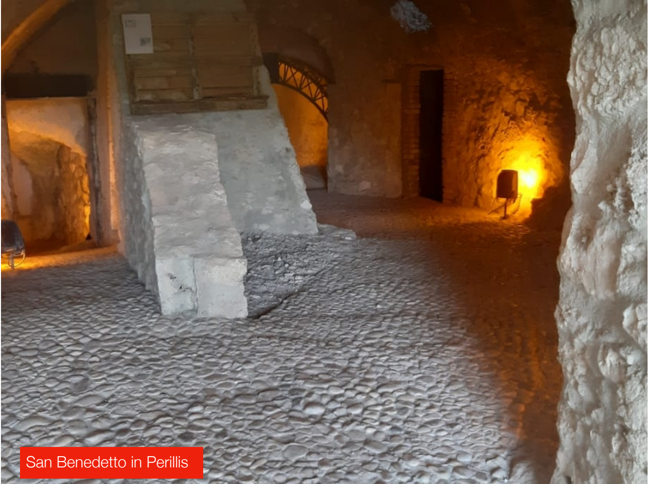
San Benedetto in Perillis