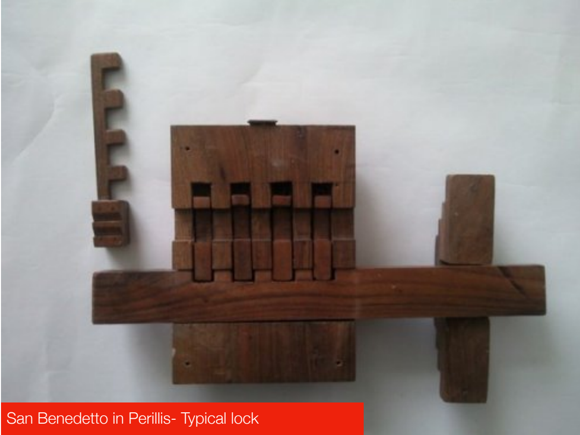
San Benedetto in Perillis- Typical lock