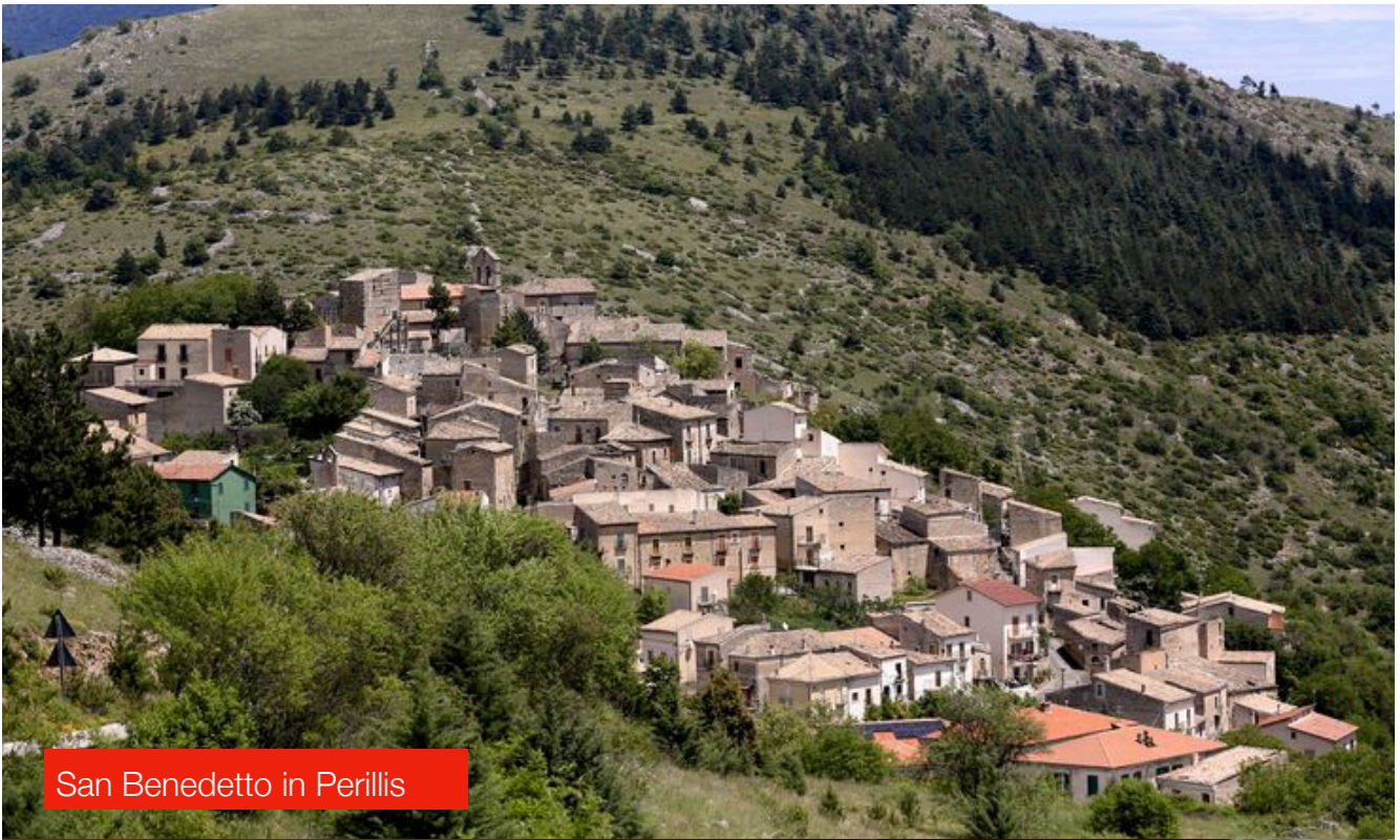
San Benedetto in Perillis