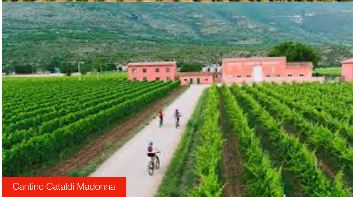
Cantine Cataldi Madonna