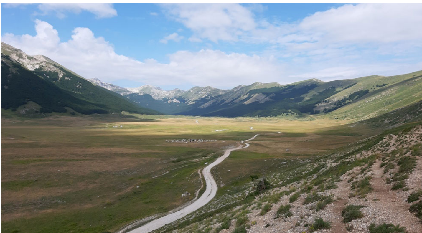
Road through Altipiano delle Rocche

Celano is one of the main cities of Marsica and dominates the Fucino plain from above. Its territory is partly included in the Sirente-Velino Regional Natural Park.