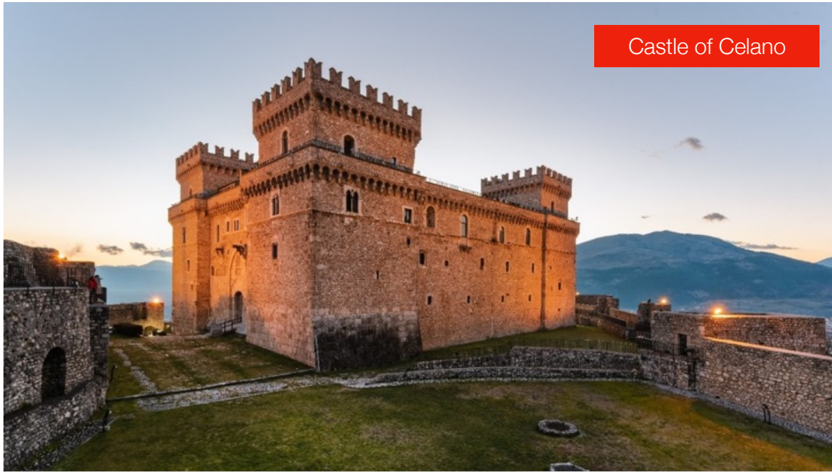
Castle of Celano

hosts the headquarters of the Marsica Museum of Sacred Art and the Torlonia Collection of Antiquities of Fucino. Also interesting are the parish church of S. Giovanni Battista, that of S.M. in Valleverde and of the Madonna della Grazie.