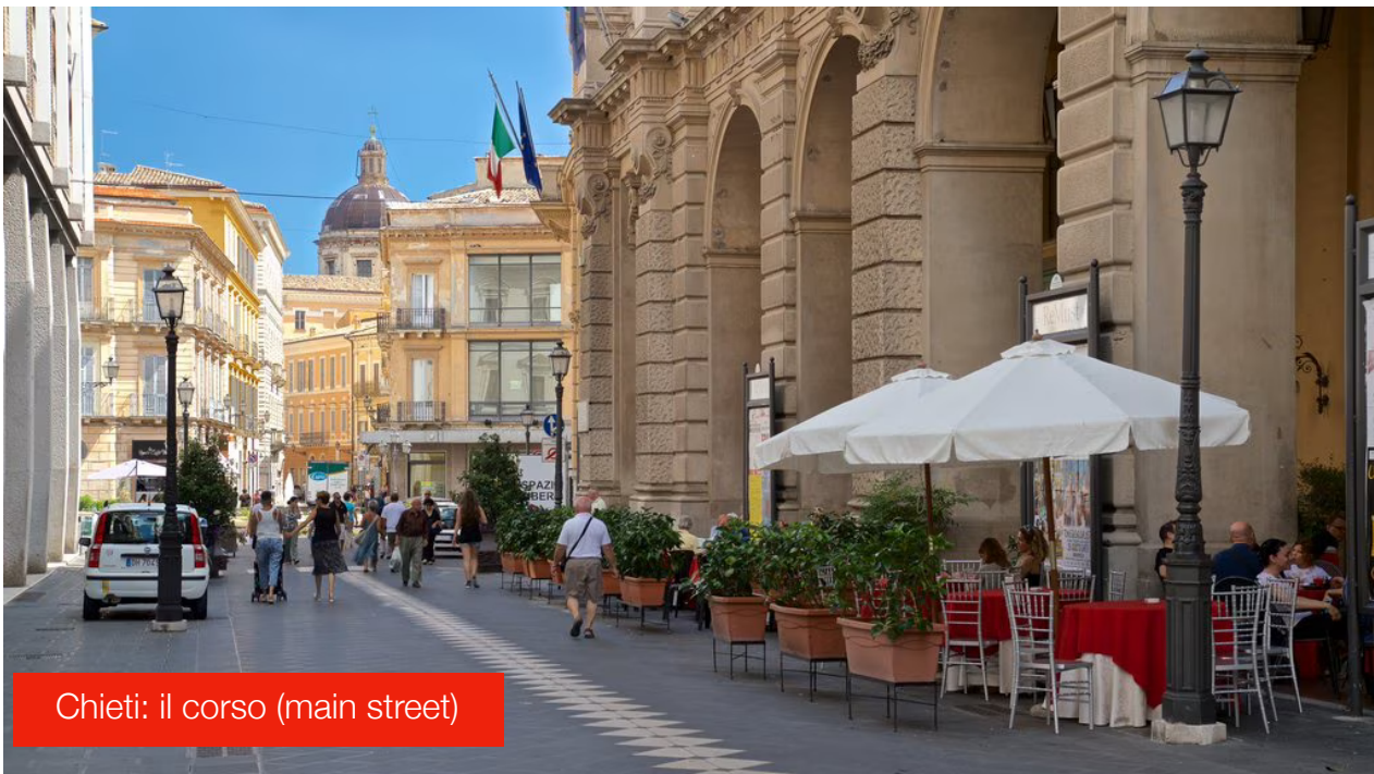
Chieti: il corso (main street)