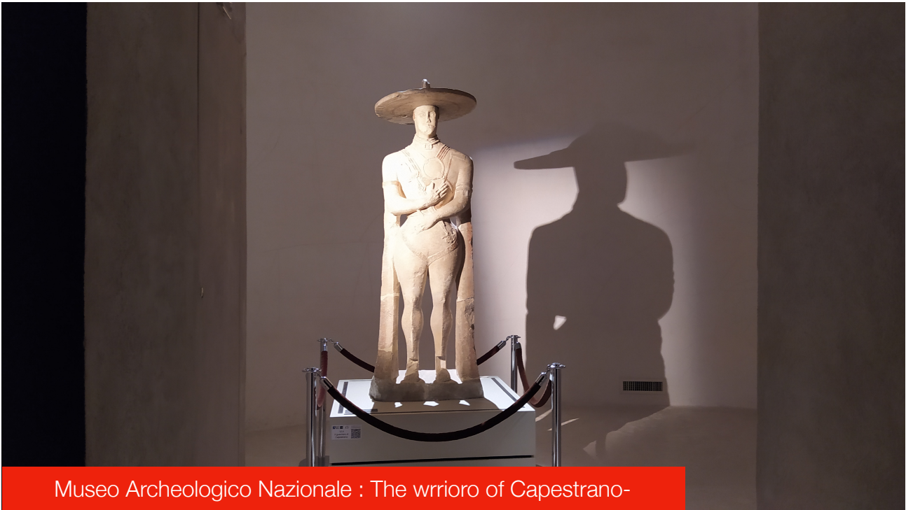
Museo Archeologico Nazionale : The wrrioro of Capestrano-