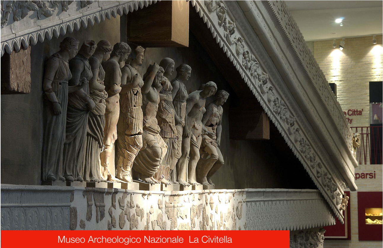
Museo Archeologico Nazionale La Civitella