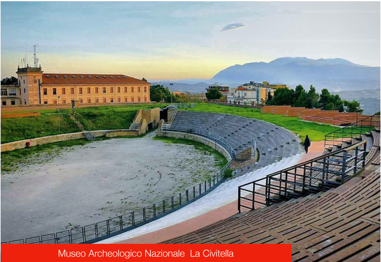
Museo Archeologico Nazionale La Civitella