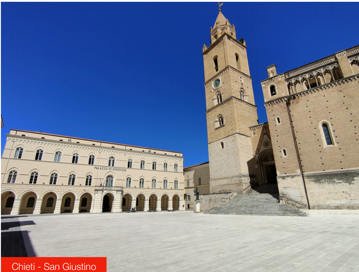
Chieti - San Giustino

Museo Civico Archeologico Antonio De Nino - Corfinio (AQ) via del Liceo, Corfinio (AQ) | www.museocorfinio.it tel. 338 1118944 | mail Cooperativa La mosca bianca info@cooplamoscabianca.org