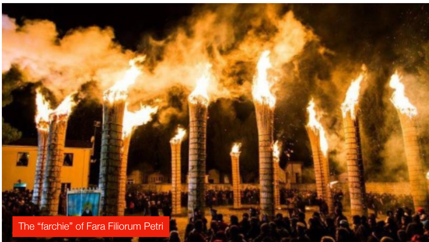
The "farchie" of Fara Filiorum Petri

Duomo hosts the splendid Collegiate Church of Santa Maria Maggiore, made entirely of Maiella stone. Inside, a procession cross by Nicola da Guardiagrele is preserved, while the Church of San Francesco, located in the square of the same name, houses the remains of Saint Nicholas the Greek. Other very important places of worship are the Church of San Nicola di Bari, one of the oldest in the city and built on the remains of a pagan temple, the Church of San Silvestro, the Capuchin convent, the Church of San Rocco, the Church of Santa Maria del Carmine and the Church of Santa Chiara.