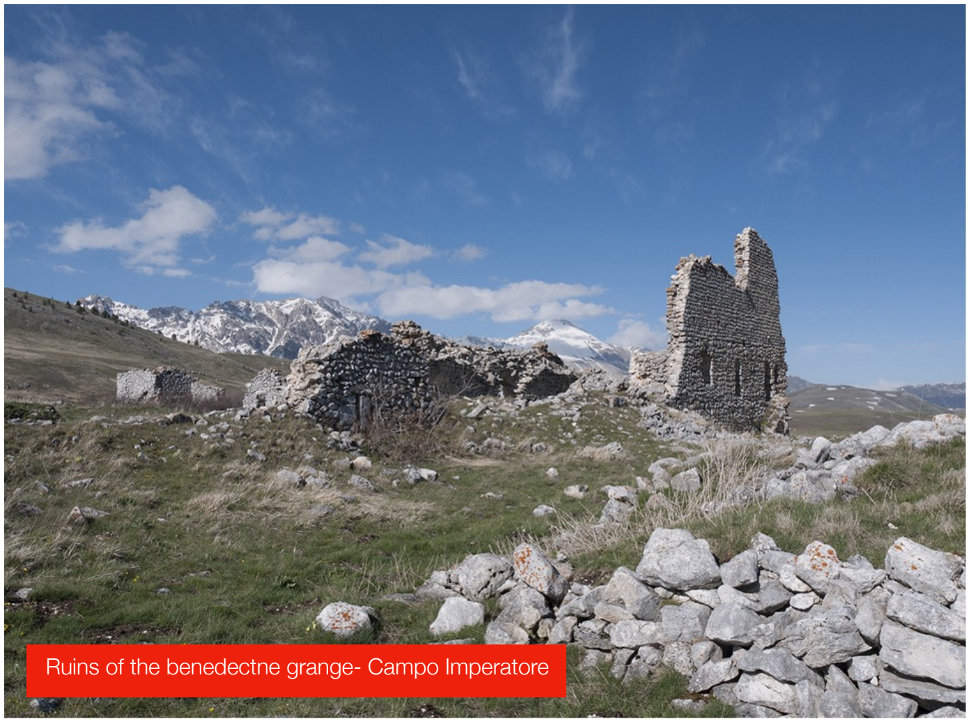
Ruins of the benedictine grange- Campo Imperatore