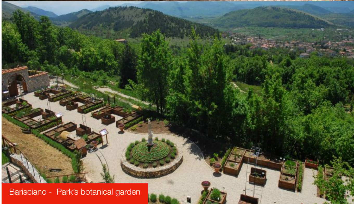
Barisciano - Park's botanical garden