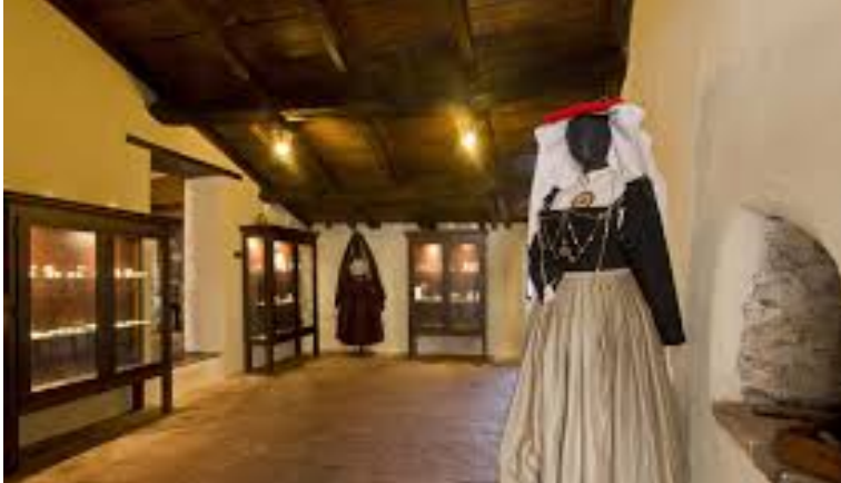
Calascio and its Rock