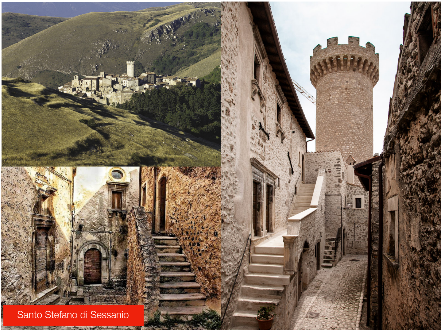
Santo Stefano di Sessanio

Now a very well-known destination (avoid going on summer weekends), its streets alternate old renovated homes, noble buildings and the famous Medici Tower.