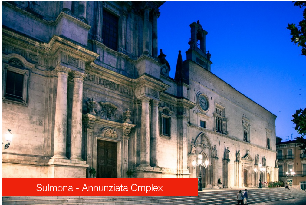
Sulmona - Annunziata Cmplx