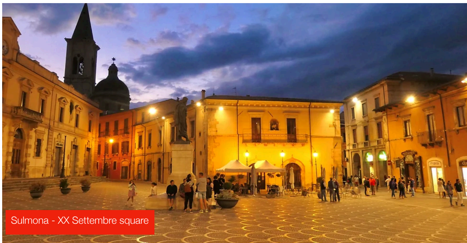
Sulmona - XX Settembre square

A visit to the Pelino factory is unmissable, as it has supplied sugared almonds for all the British royal weddings in recent decades. Pelino offers an interesting historical museum of sugared almonds and the company shop, with every quality of sugared candies... and the possibility of tasting before purchasing .