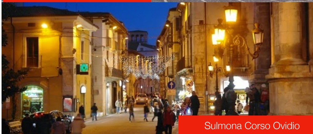
Sulmona Corso Ovidio