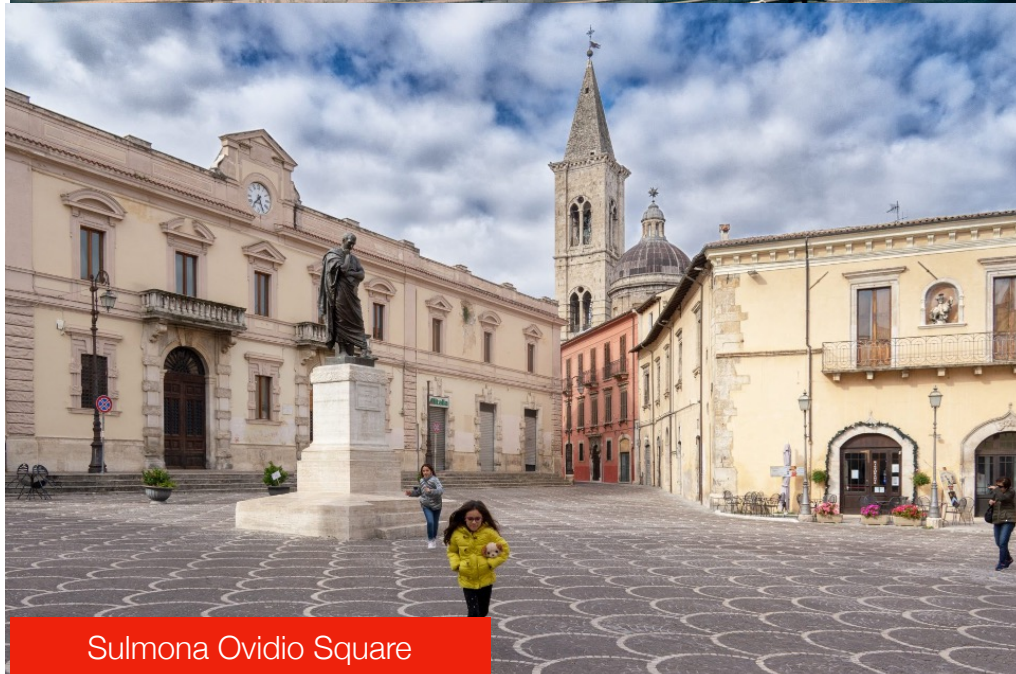
Sulmona Ovidio Square